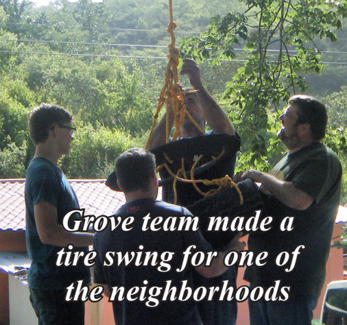
Grove team made a tire swing for one of the neighborhoods

Saturday night the team hosted our biggest campfire activity yet here at CRC with many people from the villages of Crucita and Promesas joining our regular youth from Tegucigalpa.