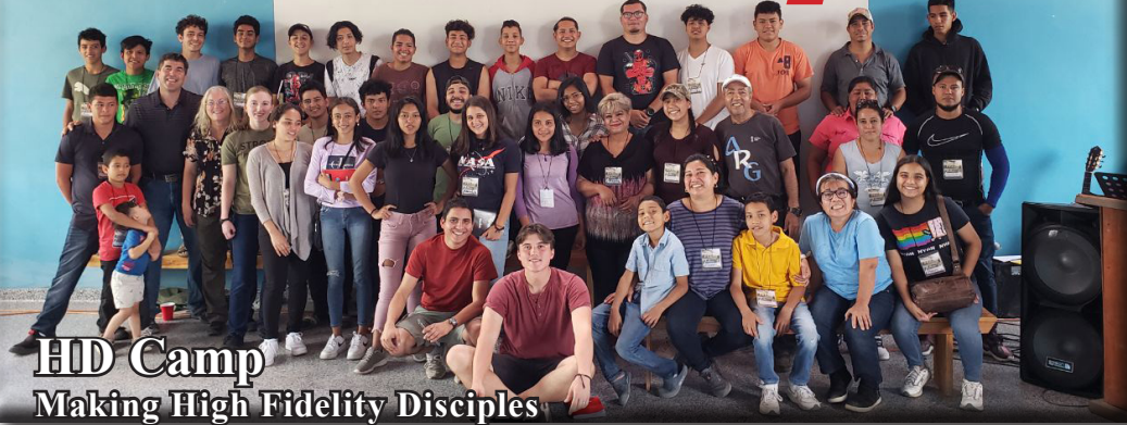
HD Camp Making High Fidelity Disciples