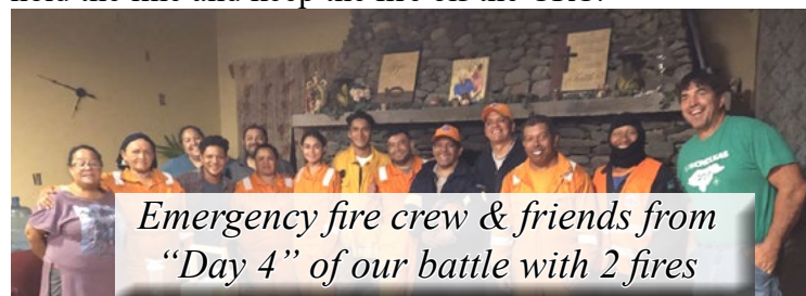
Emergency fire crew & friends from "Day 4" of our battle with 2 fires

F orest fires threaten Honduras every dry season. This year we had two big fires threaten the CRC property in the same week. From Monday to Thursday the fires attacked the CRC on three sides. With God's blessing and the help of many friends we managed to hold the line and keep the fire off the CRC.