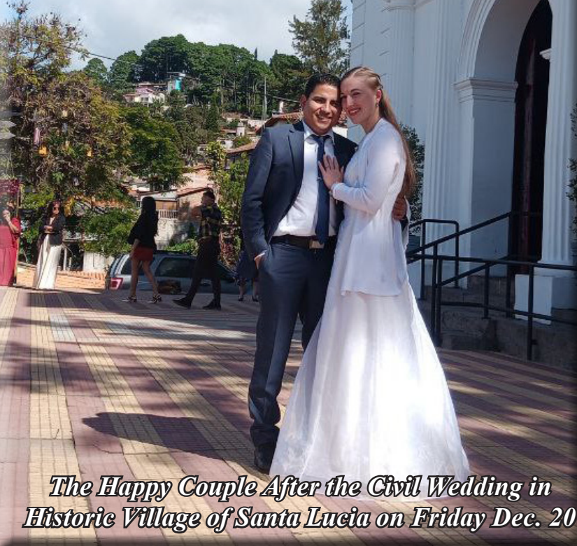
The Happy Couple After the Civil Wedding in Historic Village of Santa Lucia on Friday Dec. 20